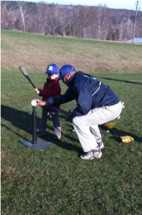
Batting Practice - T-ball 2015