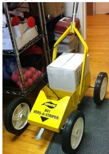
Field Striper Ready to Go