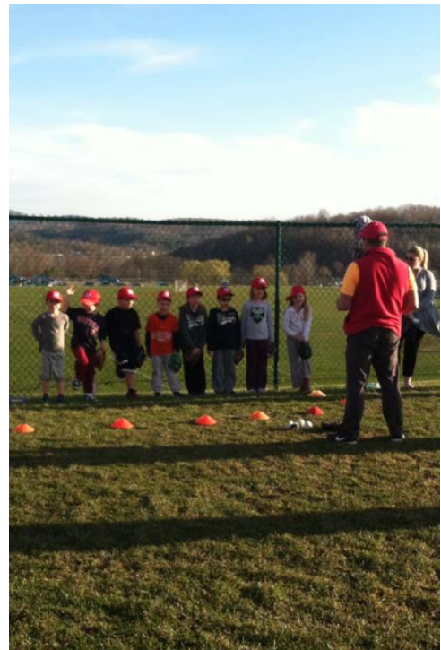
Coach Talking T-ball with the Red Team